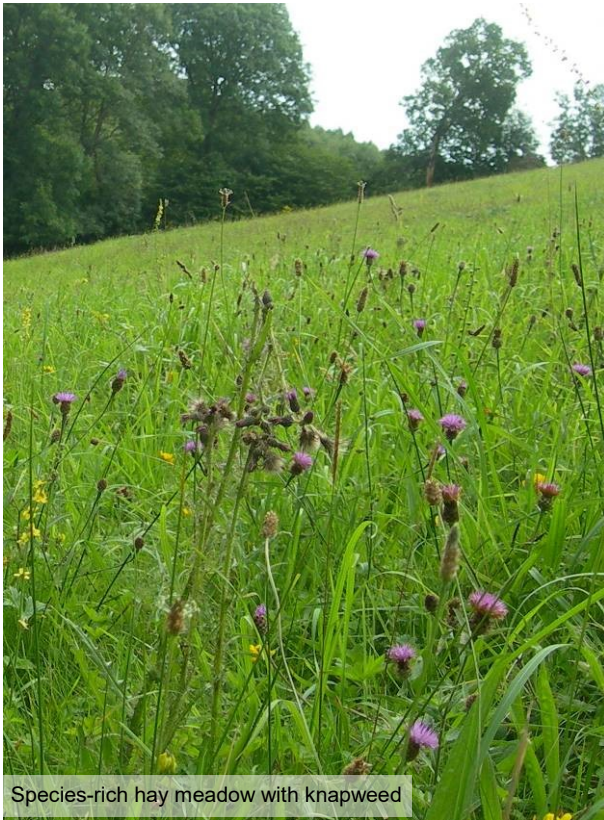
Species-rich hay meadow with knapweed

Manage scrub encroachment and clear scrub if it is abundant. Some scrub along the field margins or scattered within the site is beneficial providing habitat for insects and birds.