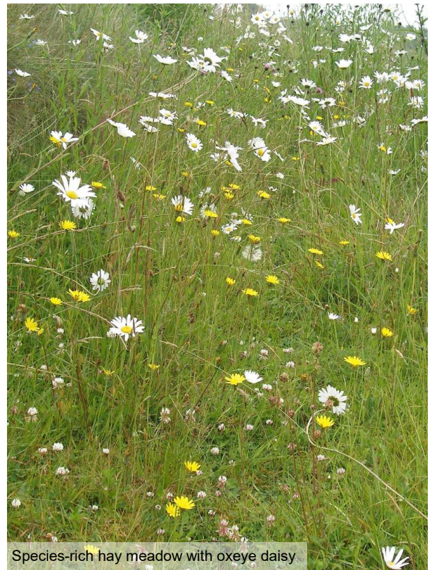
Species-rich hay meadow with oxeye daisy